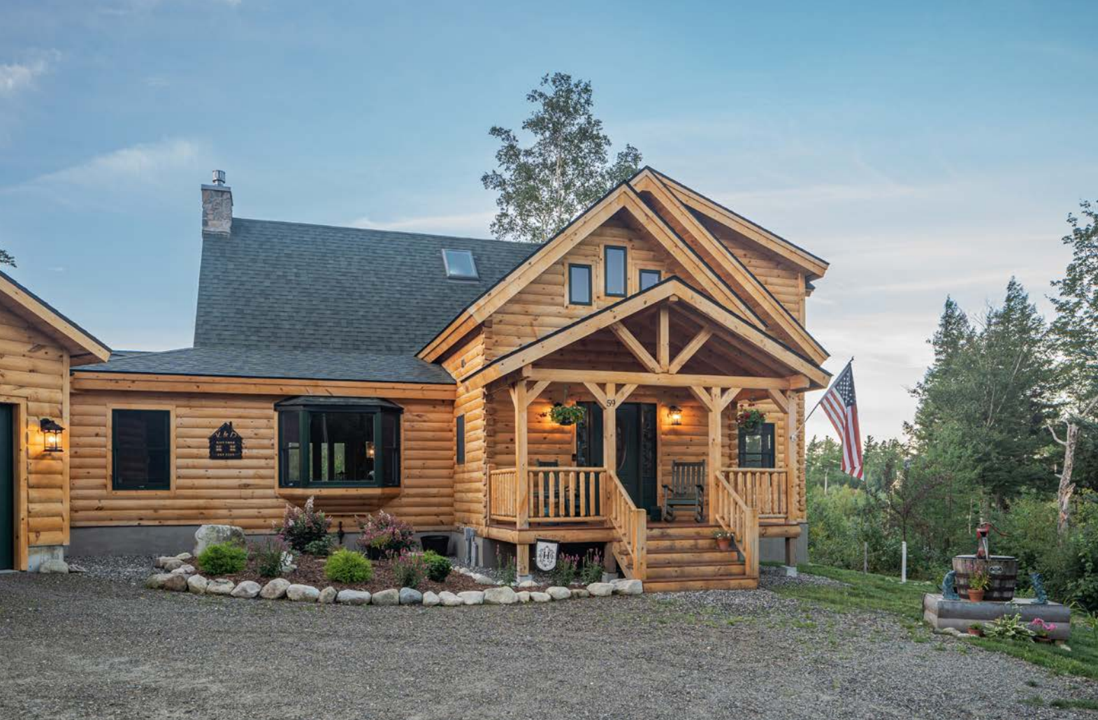
left The home's entry, punctuated by a king-post truss and a series of stacked gables, creates serious curb appeal. "The rooflines are just stunning and drew us in first thing," says Diane. Next, the couple says they were won over by the clear sightlines through the house. "You can open the front door and see all the way to the view in the back," she says.