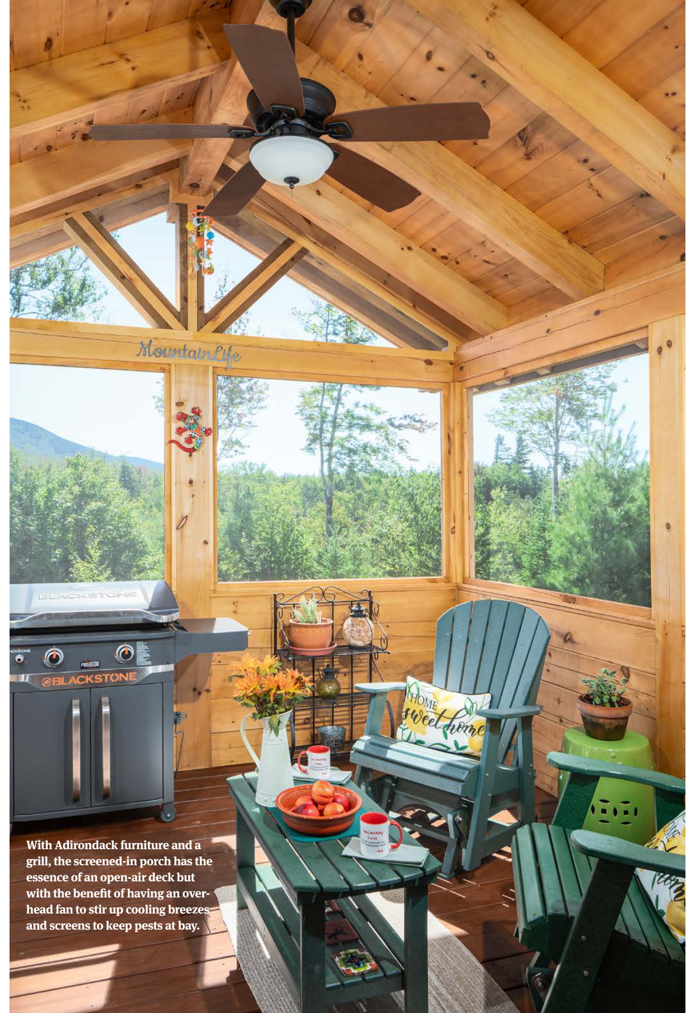
With Adirondack furniture and a grill, the screened-in porch has the essence of an open-air deck but with the benefit of having an overhead fan to stir up cooling breezes and screens to keep pests at bay.