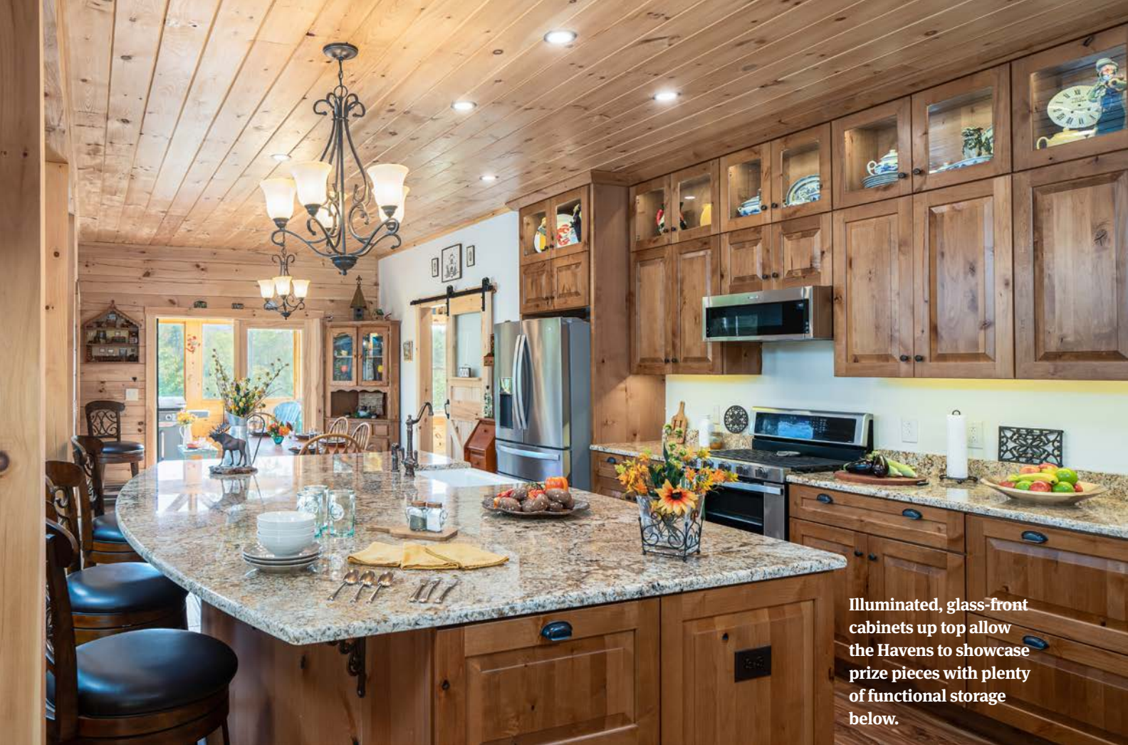
Illuminated, glass-front cabinets up top allow the Havens to showcase prize pieces with plenty of functional storage below.