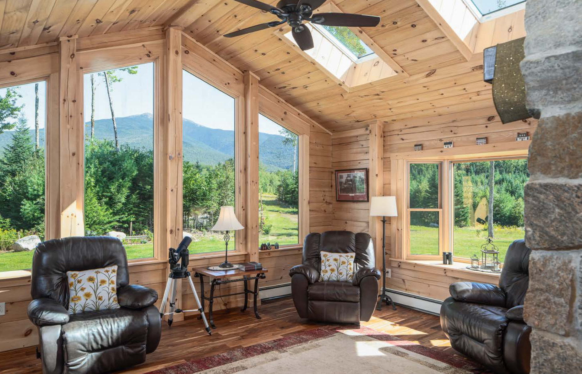
left Connecting to the great outdoors was a key part of the couple's design mantra, as seen in the four-season room where massive windows and skylights provide views in every direction.