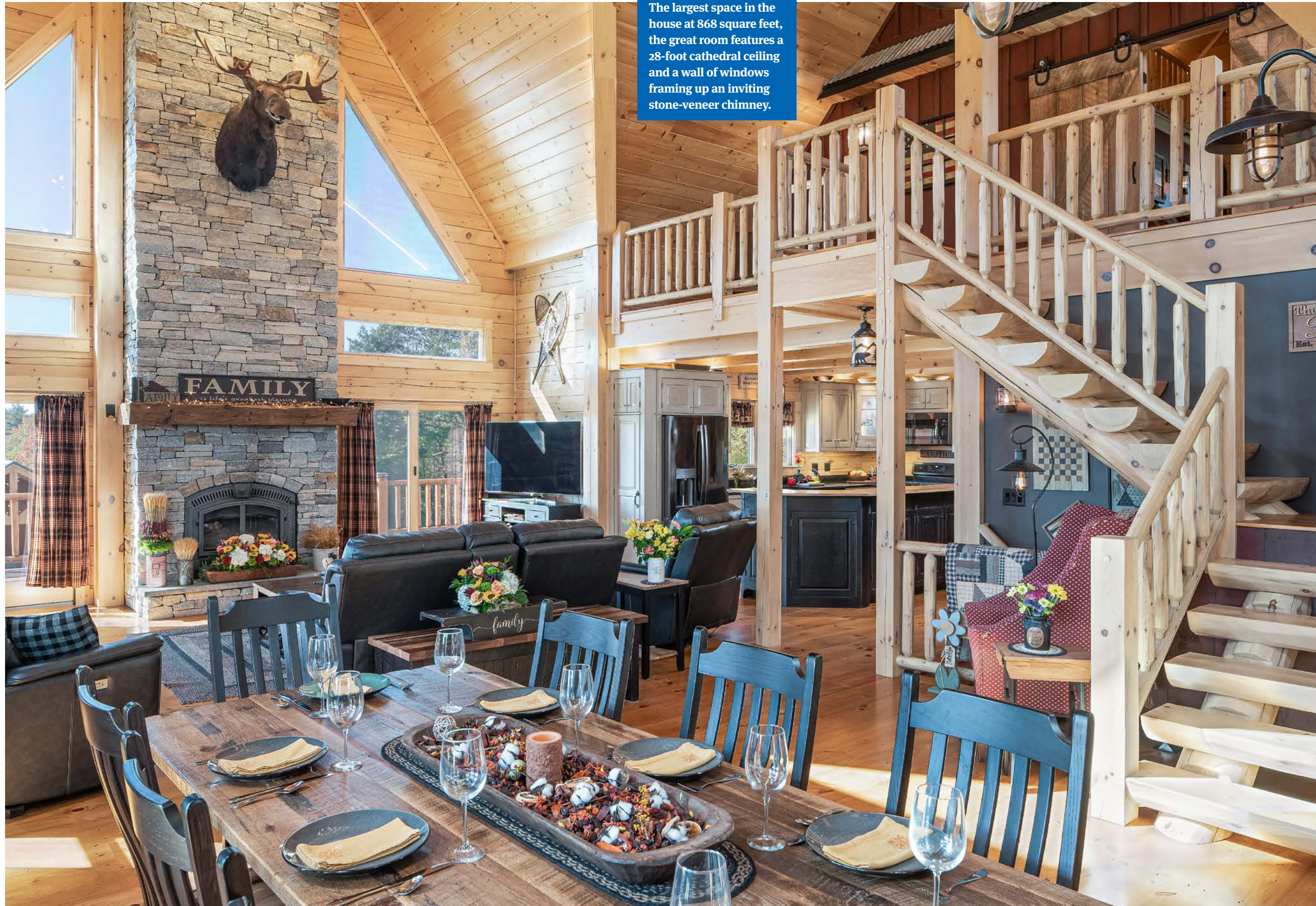
The largest space in the house at 868 square feet, the great room features a 28-foot cathedral ceiling and a wall of windows framing up an inviting stone-veneer chimney.

Both inside and out, the home is highly functional and more than hospitable. “My favorite indoor space has to be the great room,” Michele says, “especially in the colder months when the fireplace is roaring. Great family times and memories are made there. Each member of our family has their usual spot in the room where our seating just happened to create a family circle of sorts. And with our open