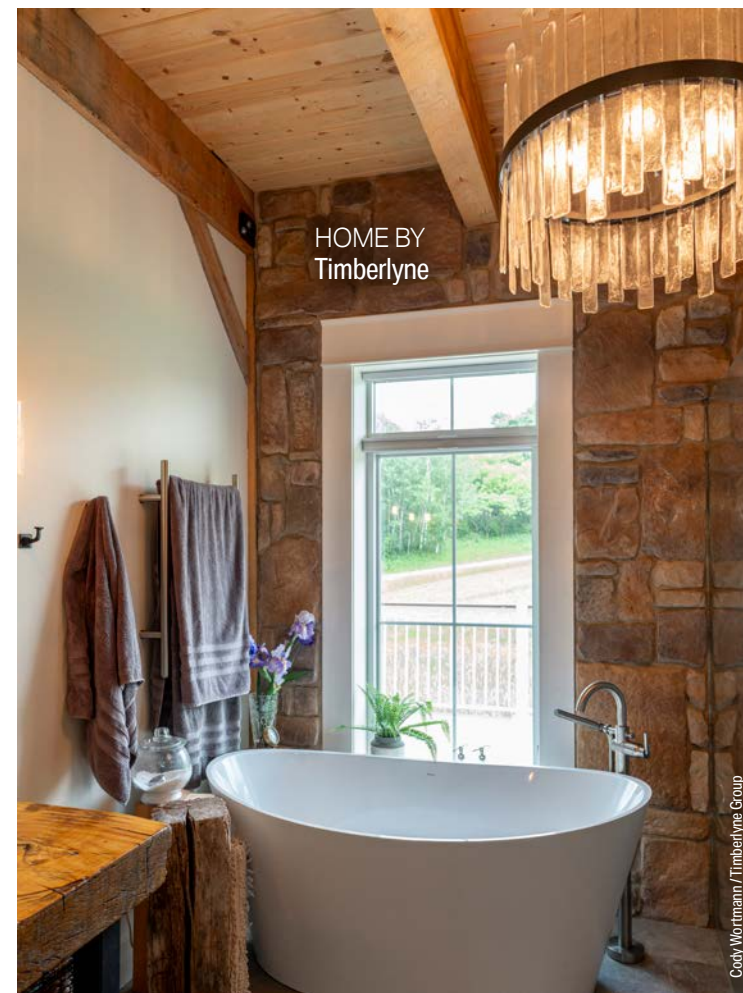
HOME BY Timberlyne