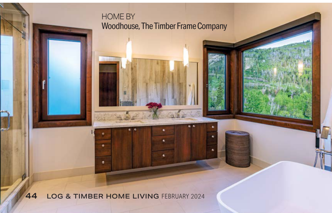
HOME BY Woodhouse, The Timber Frame Company

see if you can't find it within your current design. If you look closely, you just might discover the storage and square footage you desire are hidden all around you. We'll show you how a little creativity can transform a basic bathroom into a blissful sanctuary.