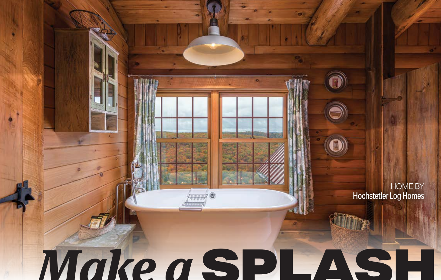
HOME BY Hochstetler Log Homes